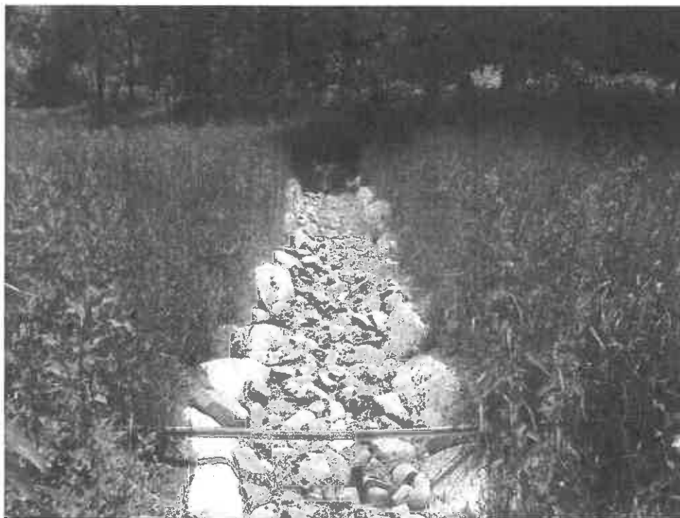
Photo: Rosewood Creek new channel and vegetation