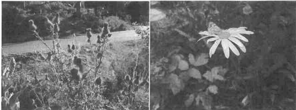
invasive Weeds: Bull Thistle and Oxeye Daisy